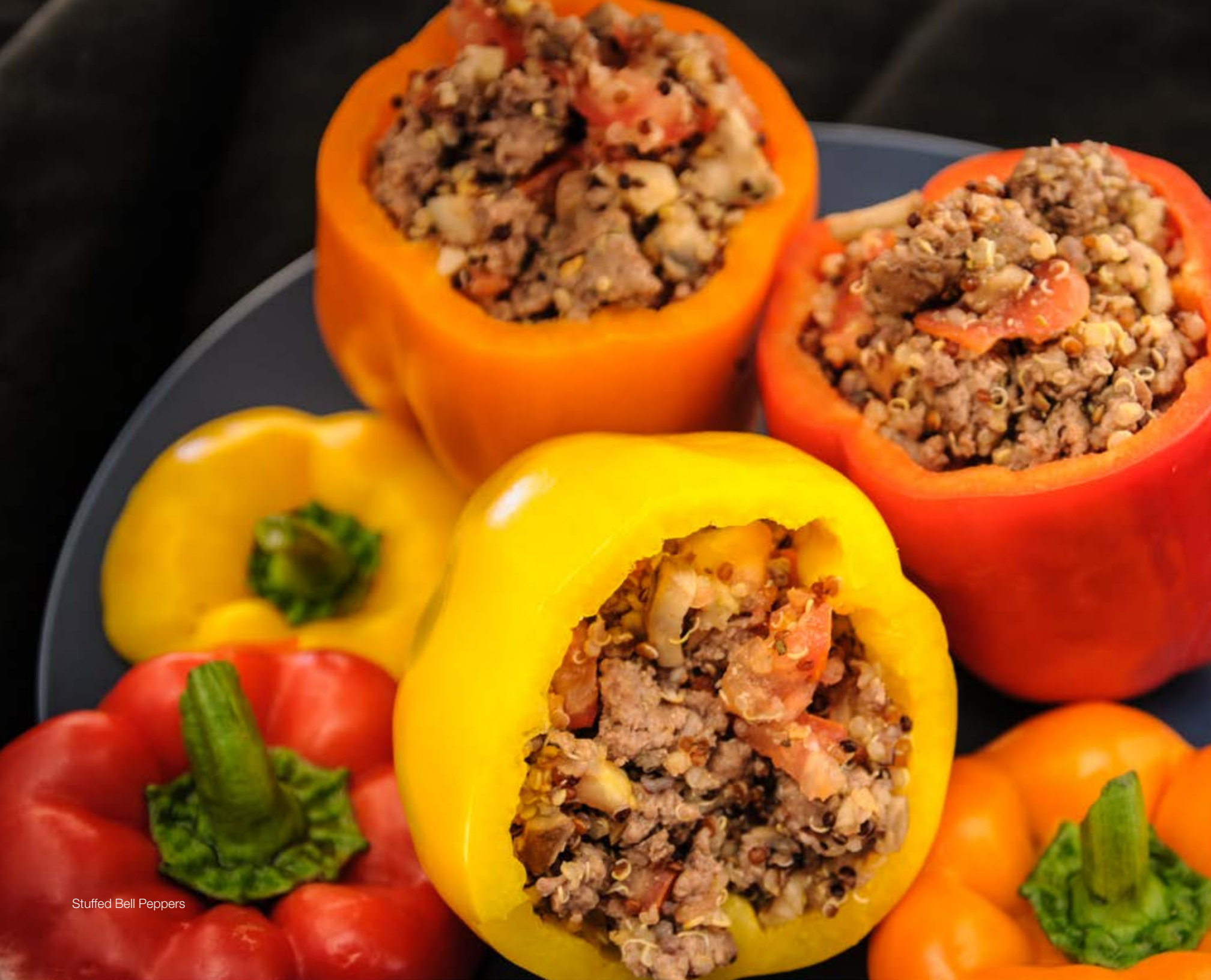
Stuffed Bell Peppers