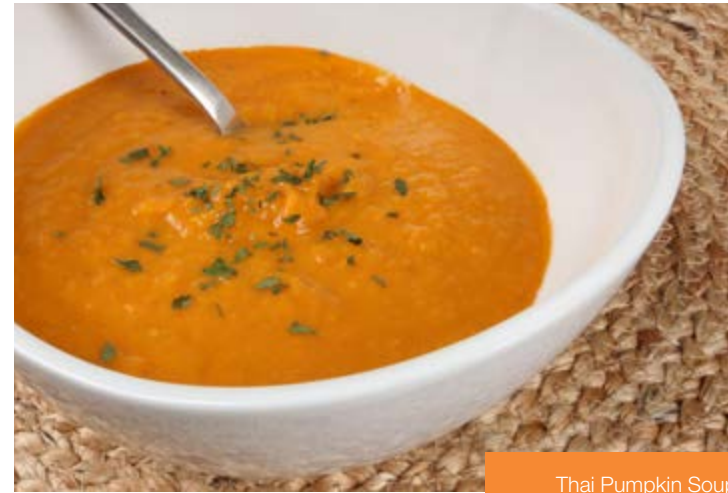
Thai Pumpkin Soup

Sauté onion in olive oil until soft. Add tomato paste, pumpkin, ginger, garlic, and broth. Combine until thoroughly heated and place in blender. Add chilies, coconut cream, coconut milk, and lemon juice. Blend for 30 seconds. Season with sea salt and pepper to taste. Serve immediately. Note: If a less sweet soup is desired, omit coconut cream and increase coconut milk to 1½ cups. Serves 2-4.