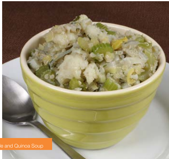
Vegetable and Quinoa Soup

Preheat oven to 350 F. Rub potatoes with 1 tablespoon olive oil and place on baking sheet. Wrap a head of garlic in aluminum foil and place on baking sheet with potatoes. Bake for 30 minutes or until potatoes are soft. Heat remaining oil in a medium sauté pan with the onion until onion is translucent, about 3 minutes. In a blender or food processor, add onion, garlic, and about half of the potatoes. Purée mix thoroughly. Transfer to a large soup pan and add all remaining ingredients. Heat to a boil, then lower heat and allow to simmer for about 15 minutes. Serves 4.